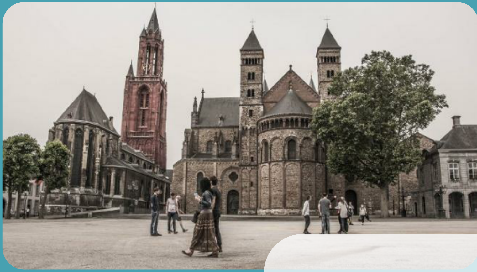
Vrijthof Square, with view onto the Sint-Janskerk and Basiliek van Sint Servaas