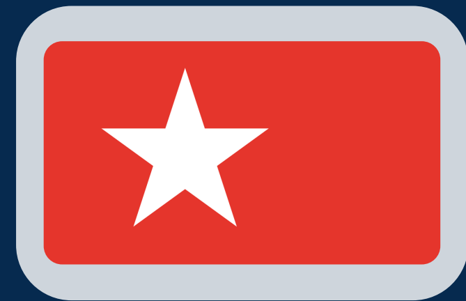
The flag of Maastricht

Finally, for those wanting to experience Dutch culture, many events are held in Maastricht, such as a traditional three-day festival for the Carnival, Vrijthof concerts by the violinist André Rieu, the Amstel Gold Race, an international cycling race, and the Jazz Maastricht festival.